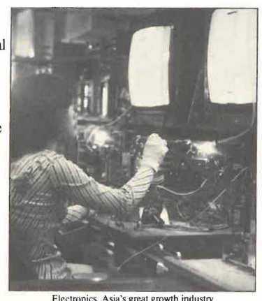
We're helping it grow.

You do not need to visit each country to obtain business information, local facts or help with government regulations. The total picture is available through all major branches of The Hongkong Bank Group.